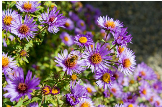
The humble, glorious Michaelmas daisy, named for The Feast of St Michael

Please arrange to swap if unavailable for the allotted date